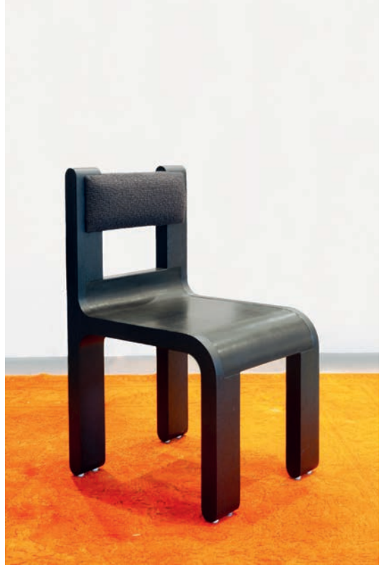
PIECES FROM ORIOR'S UPCOMING COLLECTION, INCLUDE, CLOCKWISE FROM TOP LEFT, 'THE ARCTIC WARDROBE', IN OPEN-GRAIN ASH WITH BLACKENED STEEL DOORS; 'THE ISLA CHAIR', WITH A TIMBER FRAME AND LEATHER UPHOLSTERY; AND 'THE VERT CHAIR', WHICH CONTRASTS TEXTURED FABRIC WITH SMOOTH LEATHER