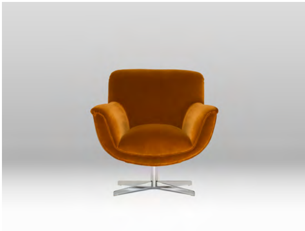
The Pop Chair - 2019