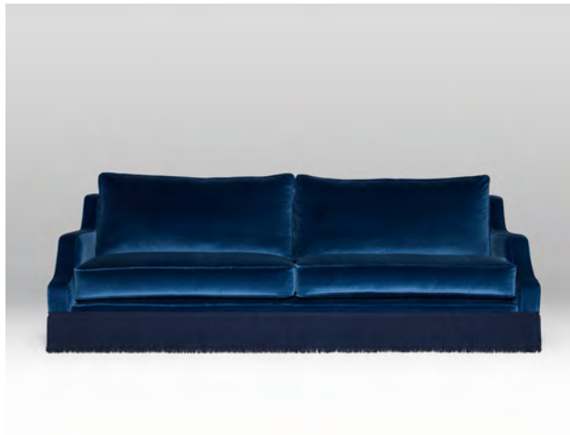
The Atlanta Sofa - 2019

Upholstered in velvet with Kvadrat wool back, finished with a chrome swivel base.