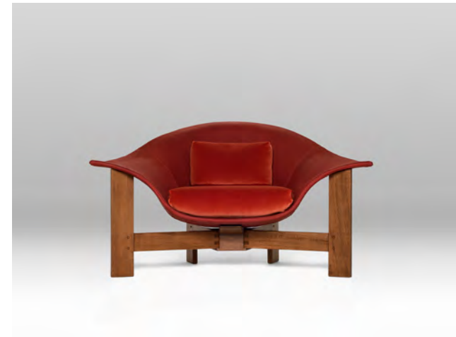
The Bianca Chair - 2019